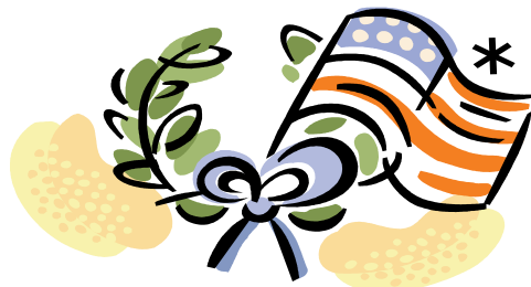
Honor Memorial Day!